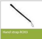
Hand strap RO03