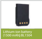
Lithium-ion battery (1500 mAh) BL1504