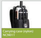
Carrying case (nylon) INCN011