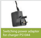
Switching power adapter for charger PS1044