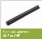
Standard antenna UHF or VHF