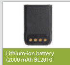
Lithium-ion battery (2000 mAh) BL2010