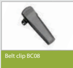
Belt clip BC08