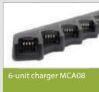
6-unit charger MCA08