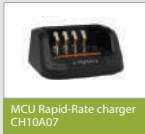
MCU Rapid-Rate charger CH10A07