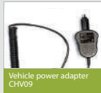
Vehicle power adapter CHV09