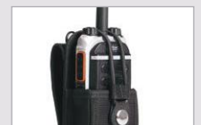
Carrying case (nylon) NCN011