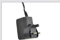
Switching power adapter for charger PS1044