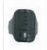
Wireless Finger PTT