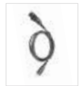
Programming Cable (USB Port)