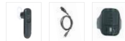
Wireless Earphone Programming Cable (USB Port) Wireless Finger PTT