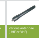
Various antennae (JHF or VHF)